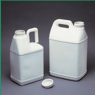
Container, thread, and lip are clean