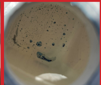
Bottom caked with dried residue

PO Box 1928, Apex, North Carolina 27502 | 877.952.2272 | info@agrecycling.org | agrecycling.org