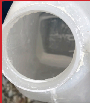
Dried formulation on thread