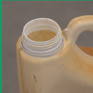
Handle and neck stained but clean