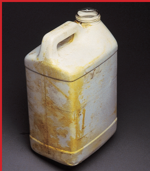
Dried formula on container