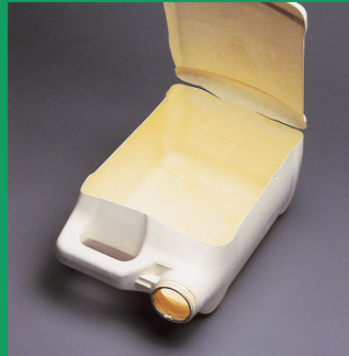
Inside stained but rinsed clean