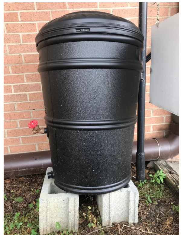
Rain Barrel

Once you have planted the right plant in the right location, set up proper irrigation systems, and mulched your gardens, you can help yourself further by harvesting what rainwater you can. Much of the rainfall that fall on our home's roofs typically leaves our property quickly and is wasted. Additionally, this fast-moving water is often damaging to our landscape and sometimes even our house. One way of solving these issues and making your landscape more sustainable is to use a rain barrel to harvest water coming off your roof. Depending on your house and landscape's size, you may be able to get all of the water you need just from your roof!