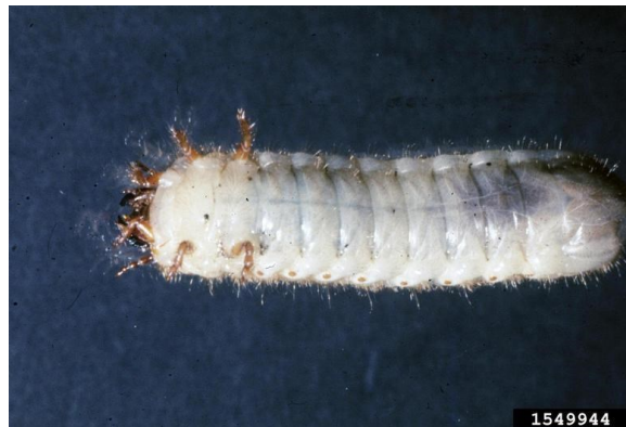
Green June Beetle Grub - Jim Baker, North Carolina State University, Bugwood.org

While green June beetle grubs don't feed on roots, they can be quite damaging and are a very unique beetle. Green June beetle grubs feed on decaying vegetation underground and damage grass root systems in the process. Green June beetles, unlike other white grubs, have the nasty habit of crawling to the soil surface to die after insecticide treatments. While all other white grubs crawl on their stomach using their legs, green June beetle grubs will crawl on their back with their legs in the air. This activity can help distinguish them from other species so that you do not spray at an inopportune time and have large numbers of grubs on your lawn.