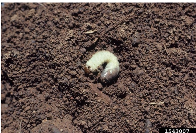
Japanese Beetle Grub

If you suspect that you have a problem with white grubs in your lawn, it is important to determine their population size in early fall. Locate a sparse area of your lawn, dig up a square foot flap of soil, and look for grubs in the top four inches among your lawn's roots. If, after doing this several times throughout your lawn, you find an average of 4 or more grubs, it is likely time for a treatment. These grubs have an annual life cycle and are smallest in the fall. As they grow, they cause more extensive damage to your lawn and are also more difficult to control.