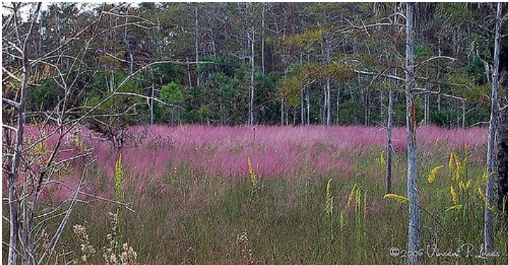
Native setting: https://plants.ces.ncsu.edu/plants/muhlenbergia-capillaris/

This plant will naturally reproduce by seed. However, if you would like to propagate the plant and would like to create more plants for yourself, you can do so by division of the roots.