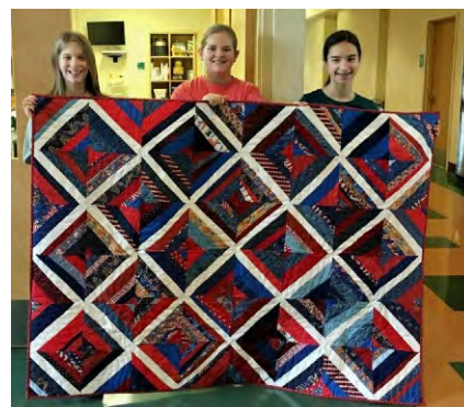
Quilt of valor