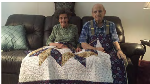
Quilt of valor recipients