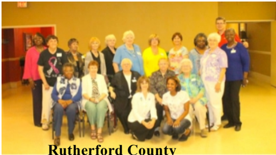
Rutherford County ECA

The Theme was Color your Future with ECA and the focus was on Butterflies and Rainbows because ECA is that Butterfly that spreads wings of love throughout the Community, and it is that Rainbow of Hope for the Future”.