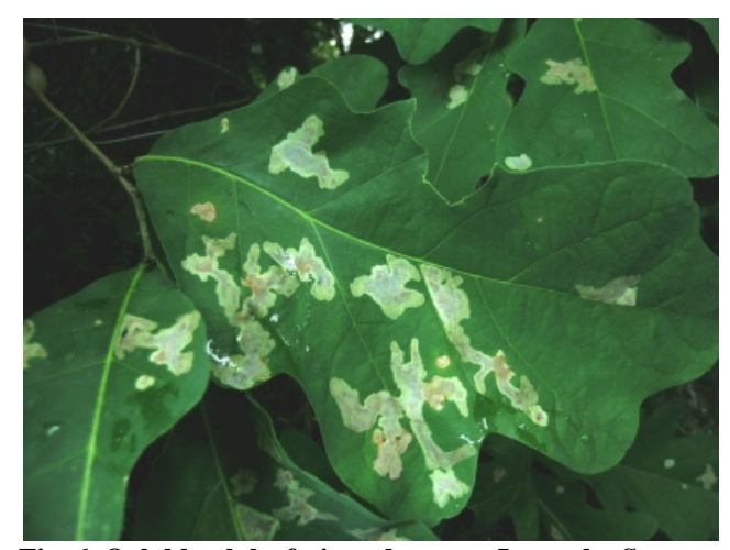
Fig. 6. Oak blotch leafminer damage.

Control by insecticides is not effective and not practical. Trees are not likely to be killed. These caterpillars are present every year, but it may be worse this year in some places. This insect overwinters as a larva in the leaf. Collecting and destroying fallen leaves may be a good idea this year. Oak trees often shed their leaves over a long period of time and may not drop them all until spring. If you are in an area surrounded by woods or neighbors with oak trees, there may be a plentiful supply of new caterpillars next year. Hopefully, the normally plentiful supply of parasitoid wasps will keep numbers lower.