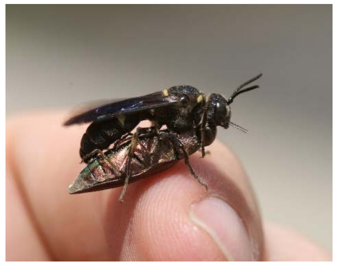
Fig. 3. Cerceris fumipennis carrying a buprestid beetle collected from the canopy.

In recent weeks Cerceris surveys in the mountains of the state indicate that the wasps are bringing in large numbers of hemlock borers ( Melanophila fulvoguttata ) (Fig. 4), a pest of eastern hemlock ( Tsuga canadensis ), throughout its natural range. Hemlock borers are secondary pests that can reach significant levels in hosts weakened by hemlock woolly adelgids and other pests (see the June 11, 2010 issue of the North Carolina Pest News at <a href="http://ipm.ncsu.edu/current_ipm/10PestNews/10News9/pestnews.pdf">http://ipm.ncsu.edu/current_ipm/10PestNews/10News9/pestnews.pdf</a>).