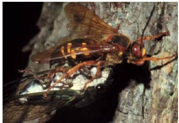
Fig. 7. Cicada killer wasp with prey.