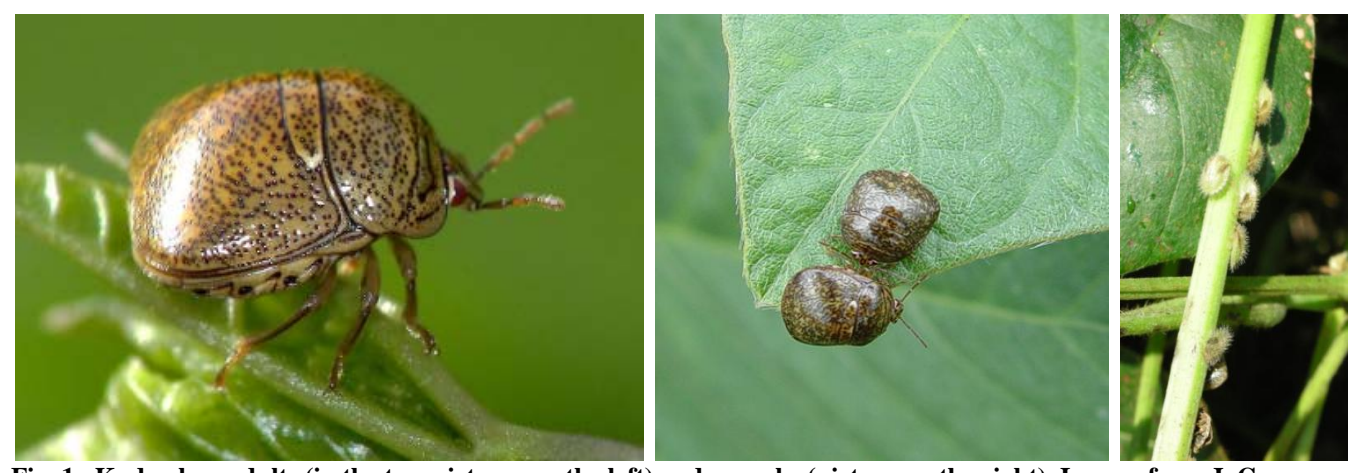
Fig. 1. Kudzu bug adults (in the two pictures on the left) and nymphs (picture on the right).

Kudzu bug moved into soybean fields in South Carolina this week, some of which were flowering. We should expect to see this insect on soybeans in our state very soon. So far, kudzu bug has been relatively easy to kill with insecticides (except with neonicotinoid insecticides), but will often reinvade. A preliminary economic threshold, based on Georgia data, is one bug per sweep with large nymphs present, or three bugs per plant with large nymphs present. This is the threshold that we will be using in our state until more information is gathered. Like stink bugs, this insect seems to invade the field edges first, so be sure to scout entire fields.