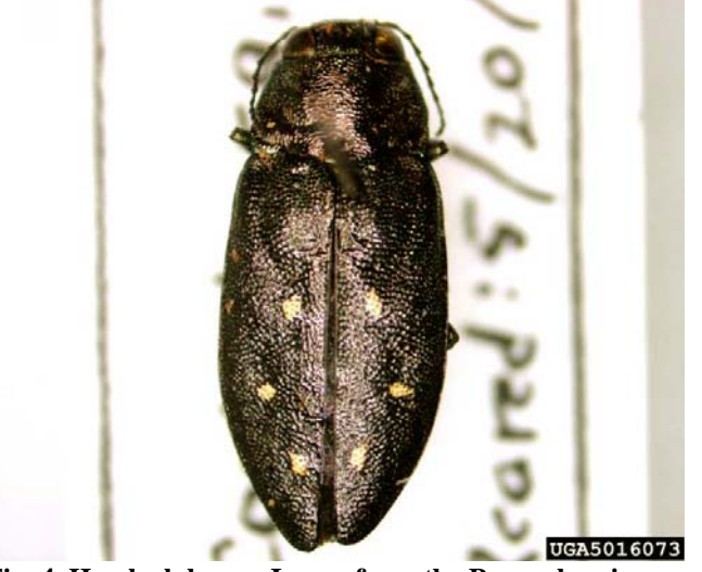
Fig. 4. Hemlock borer.

The Cerceris surveys suggest that hemlock borers may be at or near outbreak levels in some locations of the North Carolina mountains. Melanophila fulvoguttata to date has been collected in seven sites, in the cities of Andrews, Asheville, Franklin, Murphy, and Bryson City. In the latter, 97% (57 of 59) of the beetles collected from the wasps were hemlock borers. Specimens have been deposited in the North Carolina State University Insect Museum.