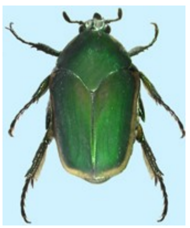
Fig. 5. Green June beetle adult.

We know that Mary had a little lamb, a little pork, a little jam. And she probably also had green June beetles (Fig. 5). Expect to see them soon. They rarely do harm to landscape plants and do not harm people. They can be handled without fear. There are possible control measures available for larvae in turf and pasture (later in the season). I have rarely ever seen this justified in residential turf (unless your backyard used to be a pasture). Grubs are sometimes a problem in pastures and heavy manure-applied fields because they like the decaying organic matter. Adults are sometimes a problem in fruit trees and grapes. Adult populations should start to decline after two weeks and they should be gone after three to four weeks. Patience 25W* (a.i. time) is the best recommendation and can be applied without environmental concern. No, that's not a new pesticide, it's called waiting . For more information on green June beetles, see the following insect notes available on the web: