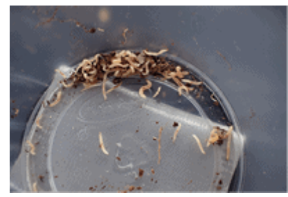
Large numbers of larvae can be found in container nursery plants.

It is important to note (due to concern of neonicotinoid use and pollinators) that many newly spring potted plants (like Itea virginica ) do not typically flower during their first growing season. Many modified varieties of Hydrangea with double flowers or sterile sepals attract few bees (Mach, 2018). Also, spring or summer flowering plants that are potted in the fall will not be attractive to pollinators at time of application.