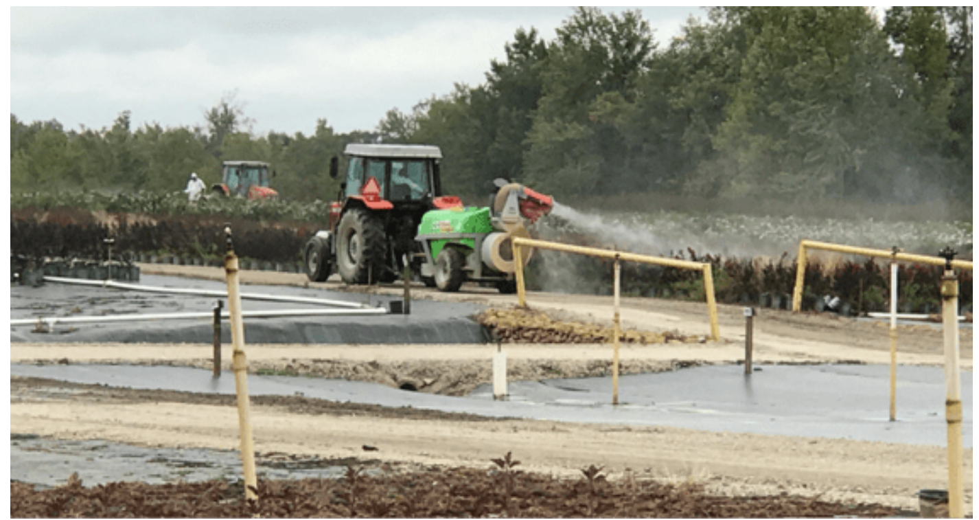
Foliar applications are often applied using air blast sprayers and hand guns.