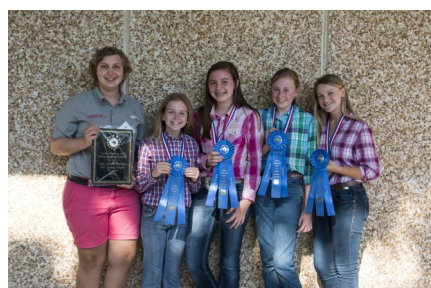
Junior High point Team: Johnston County

Complete set of results available on the website.