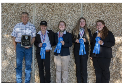
Senior High Point Team: Wake County