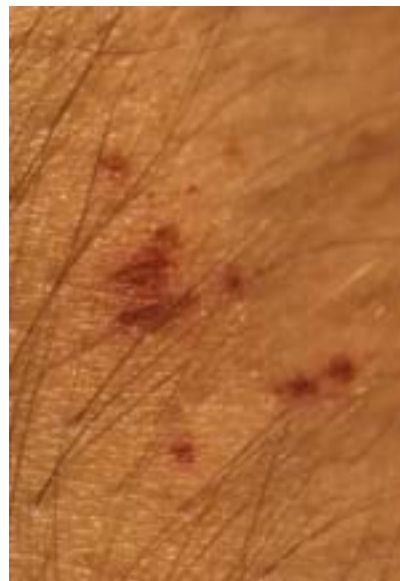
Fig. 1. Scarification indicates scratching but offers no clue as to its cause.

Scratching may produce papular eruptions. Any repeated skin irritation produces a friction blister. Repeated rubbing of an area often produces a bleb (small blister) which, when ruptured, yields an open sore that may become infected. Once the sore begins oozing plasma and a scab forms, hairs and cloth fibers become entrapped in the sticky fluid. These flecks are dislodged and called mites or insects because they look like they have "antennae" and "legs" (Fig. 2). Hair follicles often are pulled out; the follicle accompanied by the associated sebaceous gland looks like a worm.