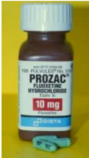
Fig. 3. Side effects of Prozac®, the fifth most commonly prescribed medication, include all five symptoms commonly attributed to delusory parasitosis—erythema, paresthesia, pruritus, rash, and urticaria.

medications per day, 15 different prescriptions per year, and consume 70% of all over-the-counter drugs. Approximately 25% of their hospital admissions are a result of incorrect prescription drug usage. One in five Americans over the age of 60 regularly takes pain medication and one in four who does so experiences side effects caused by the medication; one in ten is hospitalized as a result (Chrischilles et al. 1992).