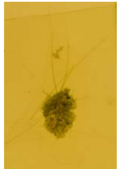
Fig. 2. A scab with entrapped hairs and fibers is said to look like a "bug."