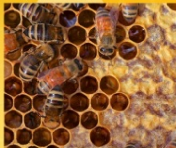
A honey bee worker tending to larva

Note that "honey bee" is properly spelled as two words, even though many otherwise authoritative references spell it as one word.