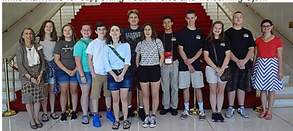
Henderson, Madison and Transylvania 4-H'ers toured the NC legislative building during 4-H Congress