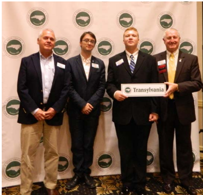
NC Association of County Commissioners meeting