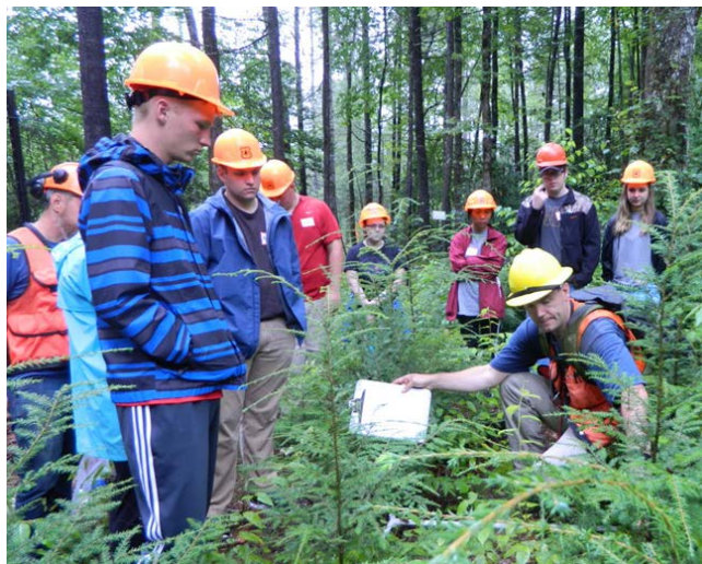
TIME for Real Science students with USFS