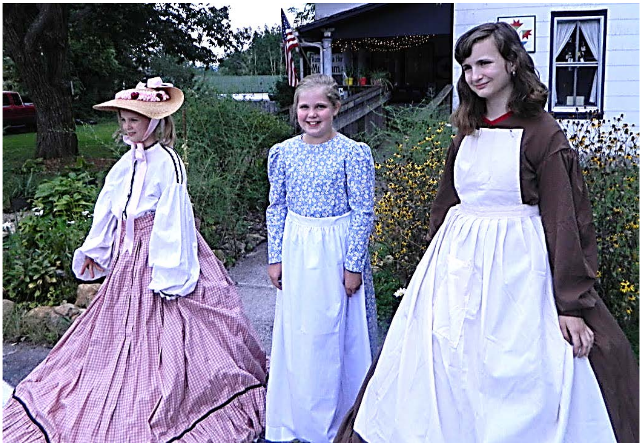
Farm Fun/History Mystery Club in period clothes