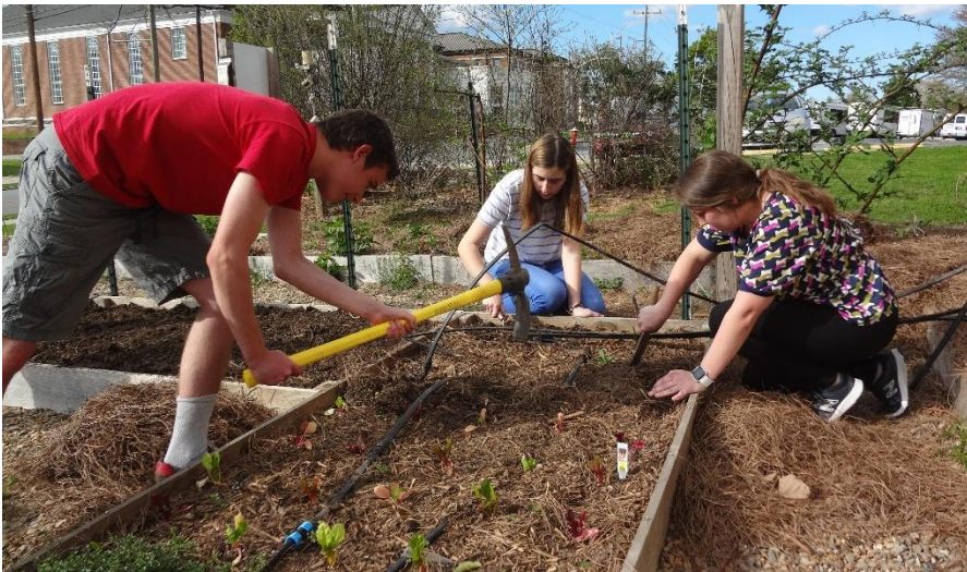
Teen Council planting vegetable starts in the community garden.