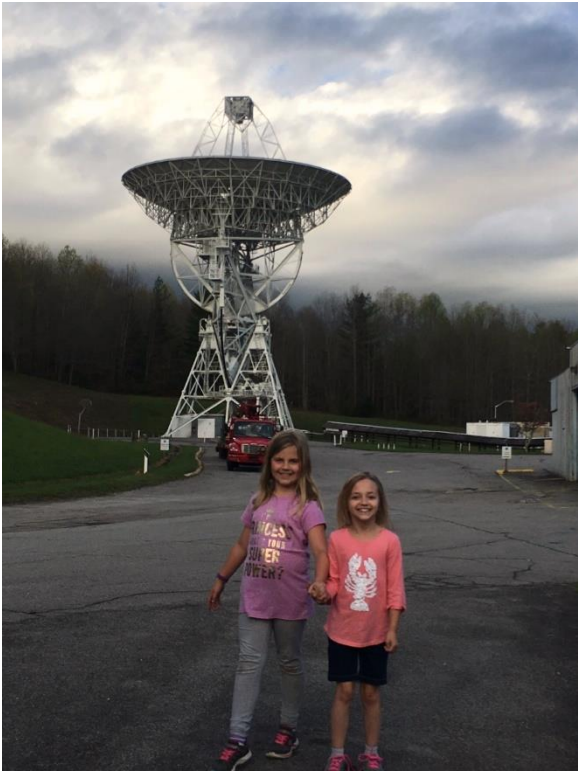
SciGirls learning about viewing the upcoming solar eclipse.