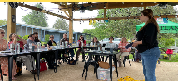
Cherokee & Clay participants seen here learning about Food Councils were rewarded for their day of brainstorming with some delicious local food from The Crown Restaurant in Brasstown.