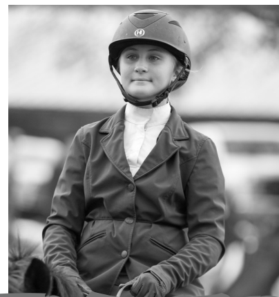
Left to Right: Youth Commission hosts School Supply Drive, 4-H Tree at the Barber Scotia Festival of T and 4-H'ers enjoy the Holiday Classic Horse Show