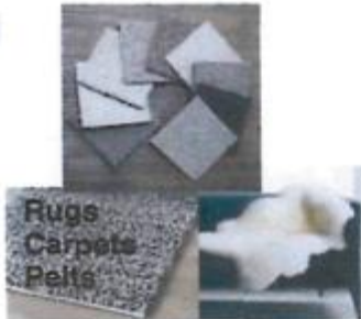
Rugs Carpets Pelts