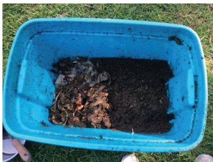
Vermicomposting produces a rich soil amendment.

or outside so long as it is protected from direct sun and extreme temperatures: 59°F to 77°F is the optimum temperature range. The bedding can be coconut coir, shredded black-and-white newspaper, paper bags, or cardboard, but no glossy paper. The bedding should be soaked in water for at least 10 minutes to ensure complete saturation, then squeezed out and fluffed up to allow air circulation. Adding a handful of healthy garden soil introduces beneficial microorganisms and helps earthworm digestion. To avoid flies and rotting odors, place small pieces of vegetable scraps under 2 inches of the bedding and only feed when needed. The castings will be ready to harvest in four to six months. An easy way to remove the worms is to prepare an identical second tub and set it directly on top of the bedding in the original tub. Placing food in the new top tub will motivate most of the worms to migrate into the new tub. The harvested nutrient-rich vermicompost can be used immediately by amending into the soil or topdressing around plants and lawns. For more information on vermicomposting, visit the chapter on " Composting " in the North Carolina Extension Gardener Handbook .