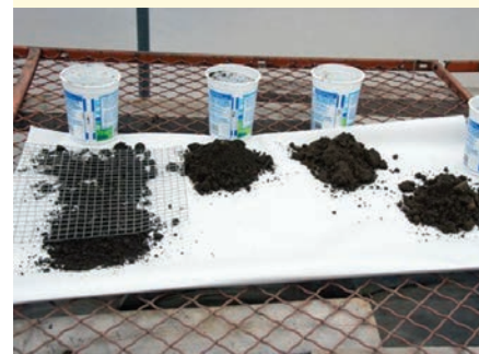
Collect soil samples using plastic containers, let soil air dry, and screen out big chunks, including rocks and sticks. Mix several soil samples from the same location before sending a sample in for testing.