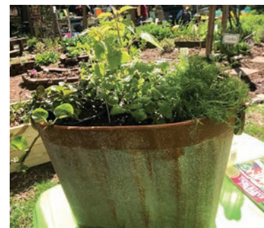
Herbs are easy to grow in garden beds or pots.