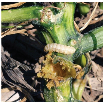
Squash vine borer larva.

The squash vine borer, Melittia satyriniformis , is a pest that vegetable gardeners have come to dread in their squash and zucchini beds. Larvae emerge in late May, burrowing into stems of Curcubita pepo and C. maxima crops, including summer squashes, winter squashes, gourds, and pumpkins. Larval tunneling causes wilting symptoms initially. But as the larvae feed and grow, the vine or entire plant eventually succumbs. If you observe wilting despite seemingly adequate soil moisture, look for small entrance holes and sawdust-like frass at the base of vines. Larvae leave the vine to pupate in the soil four to six weeks later. Adult squash vine borers are robust moths with red and black bodies and partially transparent wings. Their appearance and flight behavior are almost reminiscent of bees or wasps. Two generations per year are possible in North Carolina.