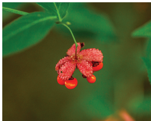
The colorful seeds of hearts-a-bustin' ( Euonymus americanus ) need periods of warmth and cold to germinate.

Last year I collected a handful of chestnut oak ( Quercus prinus ) seed while on a camping trip. I brought the seeds home and planted them in