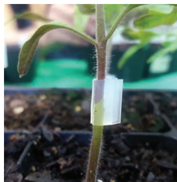
Grafting joins two plants into one with the desired resistance.

Grafting is joining two separate plants together as one. The top of one plant (the scion) is cut and grafted onto the bottom (rootstock) of another plant. There are several rootstocks that have proven resistance against bacterial wilt. Talk with your local Cooperative Extension agent to explore what is currently available. A tomato rootstock I have used that is readily available goes by the catchy name RST-04-105-T-F1. To graft, start your plants from seed. The rootstock should be started three to seven days before the scion to help the plants match up in size. The seedlings are ready to graft once they produce their second set of leaves. You can manage temperature and light to speed up or slow down plants. It is best to plant in six-pack cells for easier reach. Slice the tops off using a sharp blade and join the scion top and rootstock bottom together using a grafting clip. Place these plants in a healing chamber for about a week and then transfer to the field a week later. For more information visit: vimeo.com/266307225 or the NC State Extension publication on Grafting for Disease Resistance in Heirloom Tomatoes .