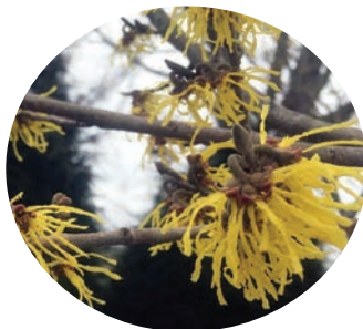
Hybrid witch hazel ( Hamamelis x intermedia ).

Hybrid winter-blooming witch hazels, blooming as early as late January, are a must-have for your garden. They offer almost 30 days of blooms, fall foliage color, and hardiness in USDA zones 4 through 9. All plants that are commonly referred to as witch hazel are in the genus Hamamelis . These winter-blooming hybrids, Hamamelis x intermedia , make up a group of hybrids between H. japonica and H. mollis . The species name indicates that they have intermediate characteristics between the other two species. The plants are loosely branched, multistemmed shrubs or small trees, usually 15 to 20 feet tall. With pruning, a specimen can be maintained as a single trunk tree. H. x intermedia prefers full sun, and moist soil. Cultivars have bloom colors ranging from bright-yellow to red. Noteworthy cultivars include 'Arnolds Promise' with yellow blooms, 'Diane' (red), and 'Jelena' (coppery-orange). For more pictures and information, visit plants.ces.ncsu.edu/plants/all/hamamelis-x-intermedia-h-x-media/ .