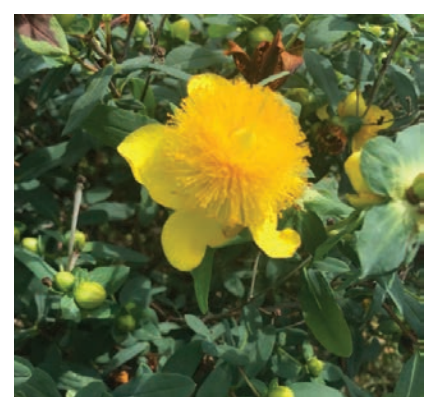
St. John's wort performs best in shade. @Lauren Hill

St. John's wort is a beautiful pollinator-attracting plant for any garden in need of a showy display of yellow flowers from late spring through summer. St. John's wort is part of the Hypericaceae family and is a perennial that likes wet areas. It performs best in partially shaded locations but can tolerate full sun. This bush has an upright habit that can reach a height of 5 feet when planted in its ideal location of moist soil and partial sun. Pollinators are attracted to this plant because of its 25 to 100 large showy flowers per stem that contain many stamens. The showy flowers and nectar source attract leaf cutter bees, bumble bees, beetles, and flies. With its ability to be propagated by seed, divisions, or cuttings, St. John's wort is an excellent addition to a pollinator restoration habitat. -Lauren Hill