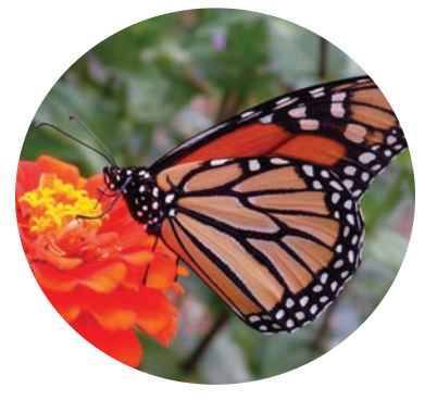
Biodiversity creates places of refuge.