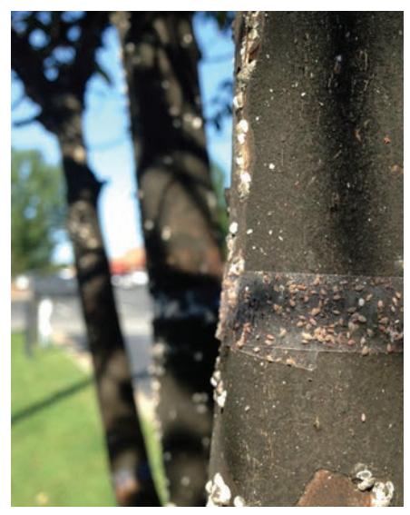
CMBS nymphs on sticky tape and adults on the trunk of a crape myrtle.

The scale can greatly reduce the appearance of the tree and aesthetics of the landscape. Honeydew produced by adults and nymphs coat portions of the trunk,