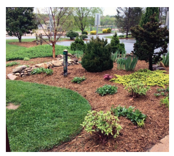
Specialty conifers come in different shapes and colors that offer year-round interest.

There are two types of Japanese maples: the palmatum group and the dissectum group. The palmatum group has leaves reminiscent of our native maples, whereas the dissectum or cutleaf