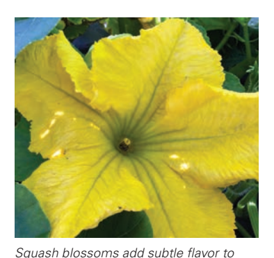
salads and other dishes.

When talking about "squash blossoms," we are referring to the edible flowers of almost every member of the genus Cucurbita. Plants produce both male and female flowers, and it is easy to tell the difference. There is a baby squash attached to the female flowers. Squash blossoms are very short-lived. Open flowers should be picked in the early morning and ideally used the same day. They can be easily stored on a paper-towel-lined baking sheet covered with plastic wrap. The flowers have a delicate flavor reminiscent of a young zucchini. They can be eaten raw or cooked, sliced, or whole. Try them on top of homemade pizzas, or cut them up in salads. Use them in quesadillas or frittatas,