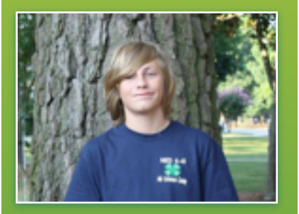
NC 4-H Congress