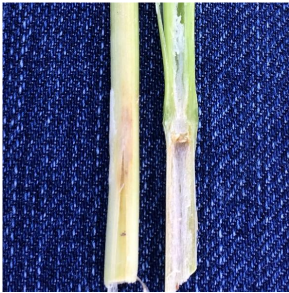
Figure 6. Left: Stem is partially opened to show extensive tissue damage and brown discoloration of stem below the joint which has frozen. Right: stem cut in cross section showing transverse band of brown, necrotic tissue just below the joint.