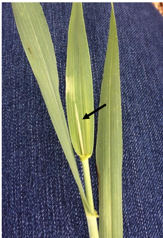
Figure 4. Flag leaf, indicated by the black arrow, emerging completely yellow in color indicating the growing point has died.