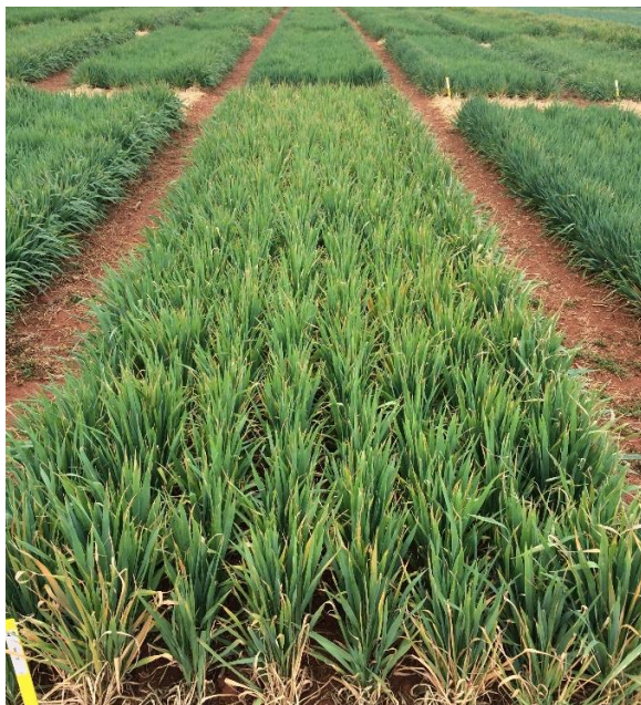
Figure 2. Whole plot in Rowan County where wheat leaf tips are bronzed and necrotic from freeze injury.

New leaves may emerge twisted yellow and necrotic, or even pinched. Many of these symptoms will show some recovery over time and new leaves and tiller growth following the freeze will usually compensate for this type of tissue damage. Yield losses should not be attributed to these injury symptoms.