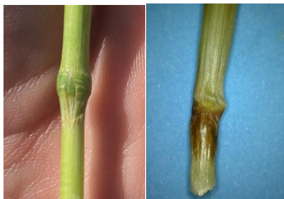
Figure 5. Left image depicts leaf sheath splitting at a swollen joint (node); right image depicts brown transverse discoloration at the crown where the stem has frozen.

split at a joint (Fig. 5, left) which has frozen due to expanding tissues when freezing occurs. The split leaf sheath does not cause a problem, but indicates the joint has likely frozen and you should continue to scout looking for brown transverse bands in the split stem as shown in Figure 6.