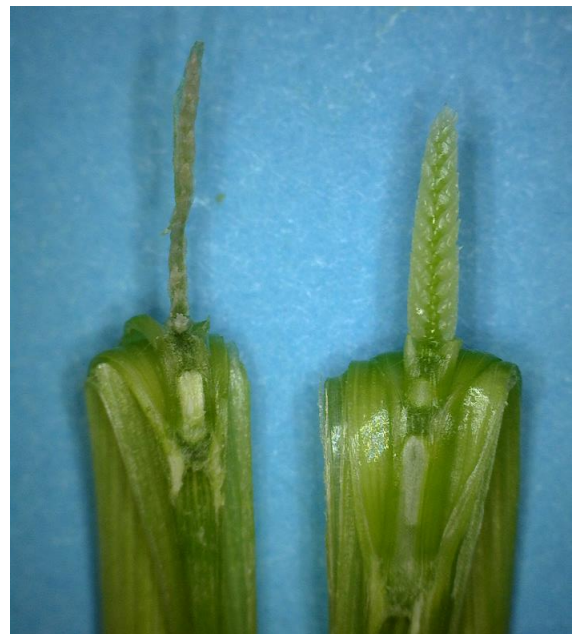
Figure 8. Left: Developing wheat head killed by freeze. Right: Healthy wheat head of the same variety from the same field.

Injury to the growing point and developing head are most detrimental to yield in winter wheat. A normal growing point and developing wheat head is shown at right in Figure 8. Normal heads should be white to green and stand up on their own when slipped out of the leaf sheath. They should appear turgid and floral structures should look full, translucent to white and glossy. Off-white to tan heads indicate the developing head has frozen and is starting to deteriorate. Affected heads will progress from light tan to brown and mushy 7 to 10 days following the freeze. Figure 8 depicts a healthy wheat head and a completely dead wheat head. These heads are at the same growth stage, are the same variety, and came from the same field.