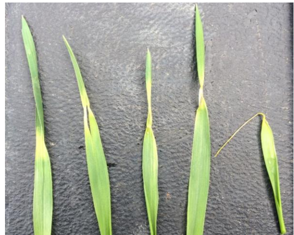
Figure 3. Varying degrees of leaf injury following 5 nights of freezing temperatures.

In contrast to leaf tip damage, injury to the flag leaf during a freeze can be detrimental to yield. A yellowing flag leaf following freeze indicates severe injury to the growing point and the head from that tiller is unlikely to produce normal grain if any at all (Fig. 4). Flag leaves appearing normal following a freeze may still have damage in the form of a pinch. Where the cold air settles in the wheat canopy the tissues expand and some of the cells will die. In that layer of the canopy a tight band of cells will form on almost every leaf including the flag leaf. Later when the developing head tries to push through that layer, awns will become trapped and the wheat head will emerge deformed, twisted, or kinked. These heads can still fill grain but the grains do not have the normal space or proper orientation to fully form. This can result in lower test weight and shriveled grain. This is not as pronounced in beardless and short-awned varieties.