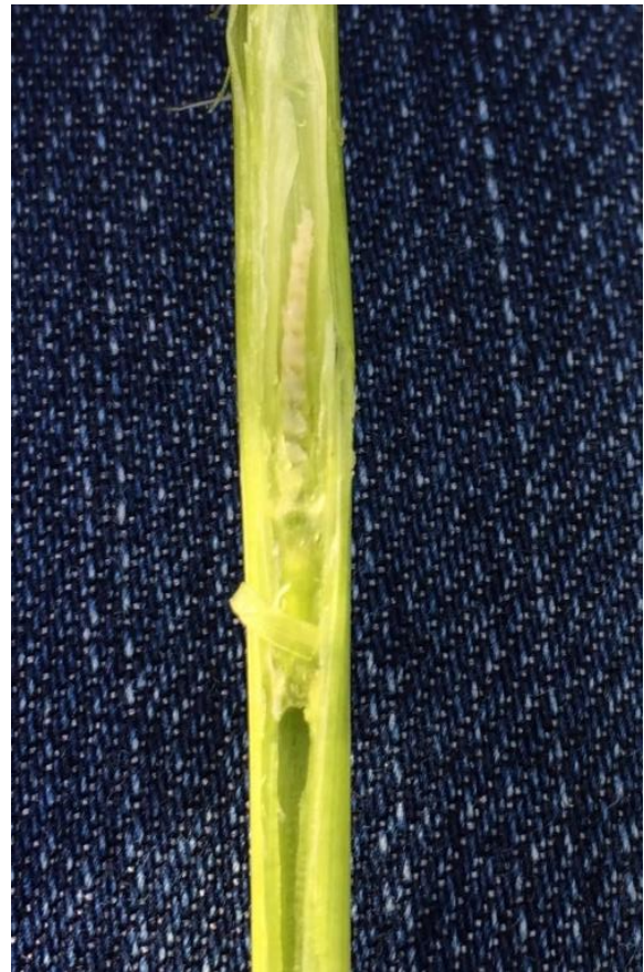
Figure 10. Developing wheat head at the second joint killed by freeze. This image was taken 7 days after the last freeze event and the discoloration and shriveling are the first signs of damage.

It is important to scout each field location. Yield losses due to freeze injury are relative to the duration and severity of the event at a specific site . Aside from developmental growth stage, topography, soil moisture, nutrient content of the plants, and wind speed and direction at a site during a freeze event can all impact potential yield losses. To assess yield potential after the freeze wait 5 to 7 days allowing damage to manifest. Count the number of viable tillers remaining in one square foot. Any tillers with severe symptoms as described in this guide should not be counted as viable. Refer to Table 1 from University of Kentucky to calculate estimated yield potential.