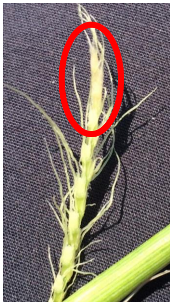
Figure 9. Developing wheat head with 30% blasted florets circled in red at the uppermost portion of the head. They appear light brown compared to healthy green ones at the base of the head.

Sometimes the entire head is not affected as in Figure 9. Here only the upper third of the head has frozen. Flowers in that portion of the head will be sterile and not produce a grain. Awns connected to empty florets will be straw colored instead of their normal green and may appear twisted or in disarray. Normally they would be upright and uniformly spaced.