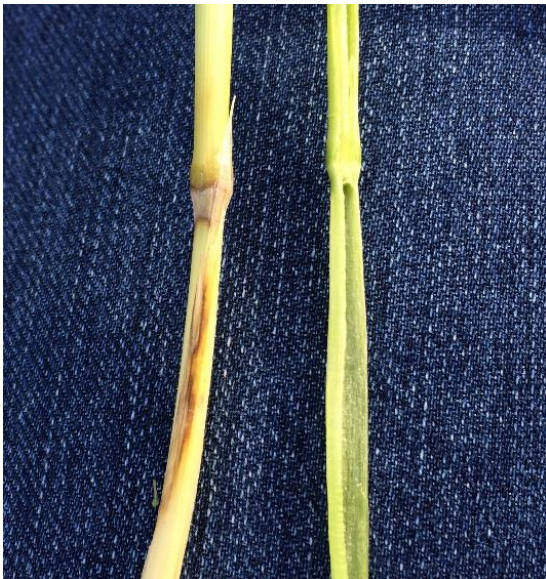
Figure 7. Left: Brown lesions appearing on the lowermost internode and just below the first joint. These freeze lesions may be a single layer or multiple layers deep. Right: Healthy wheat stem cut in cross section.