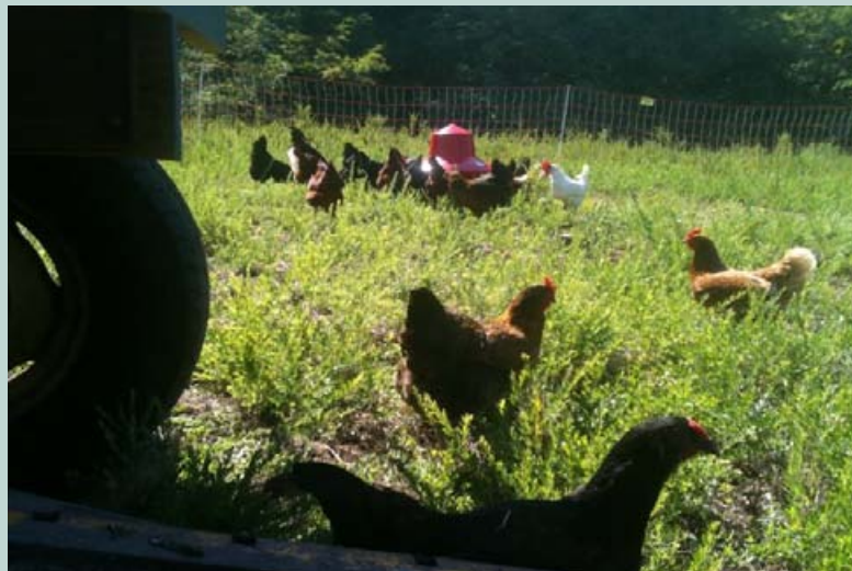
A stand of nearly pure sericea lespedeza on a clay and shale bench that has been used as poultry pasture for turkeys and layers at Across the Creek Farm in West Fork, Arkansas.