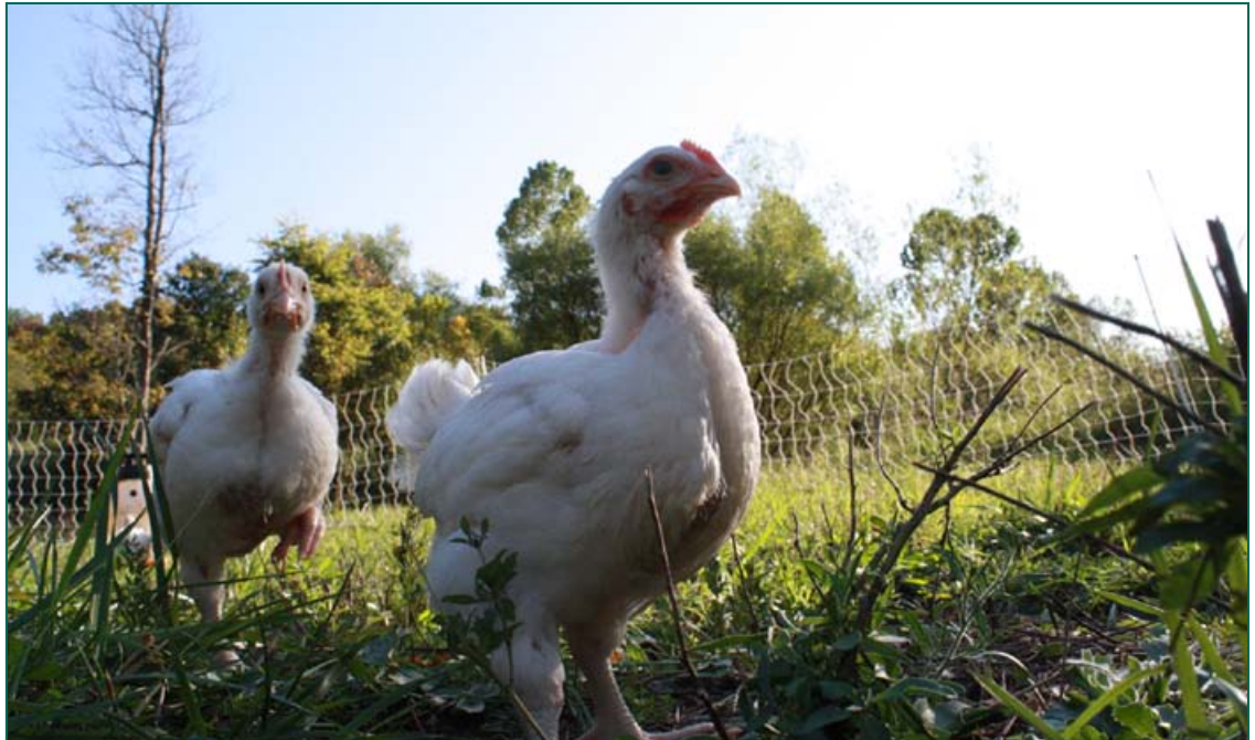
Appropriate grass height encourages foraging and vegetation consumption by the flock.

what can be digested by the animal; the remainder is indigestible.