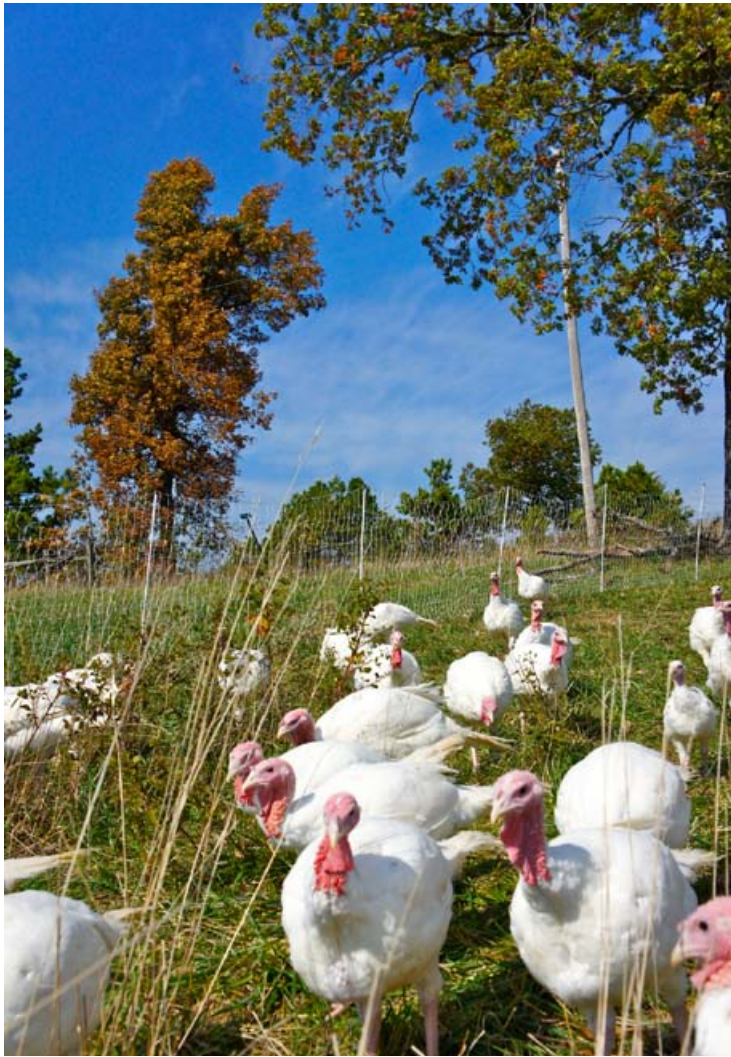
Turkeys are excellent foragers and will eagerly hunt for insects and palatable plants to consume on pasture.

forages also contain components such as fiber, protein, energy (calories), and other compounds like carotenoids and Omega-3 fatty acids that are important for metabolic functions in all animals, especially humans. The specific benefits that poultry gain from forages are explored below for each nutritional group.