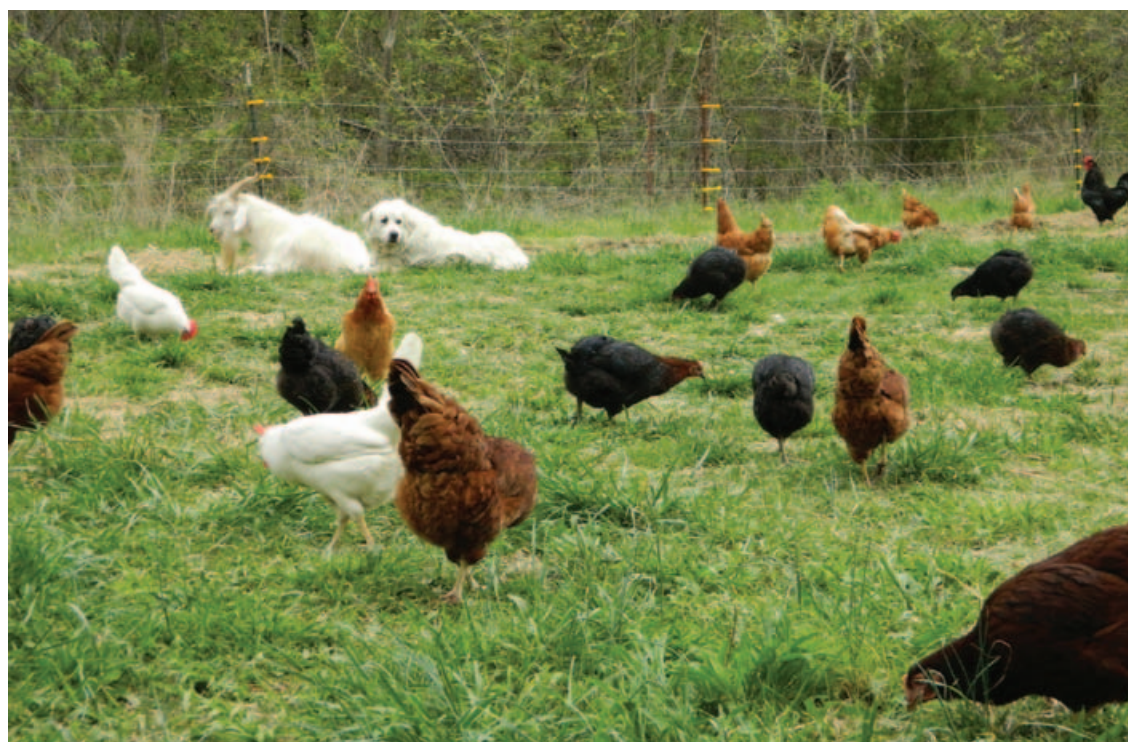
Laying hens, both commercial and heritage breeds, are enthusiastic foragers on pasture.

This publication was funded in part by a USDA SARE (LS10-226) project.