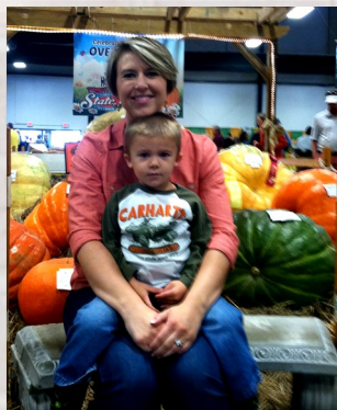
We always enjoy checking out the giant pumpkins at the State Fair!