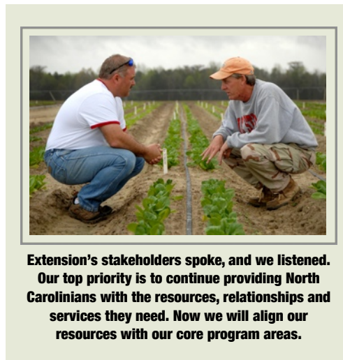
Extension's stakeholders spoke, and we listened. Our top priority is to continue providing North Carolinians with the resources, relationships and services they need. Now we will align our resources with our core program areas.