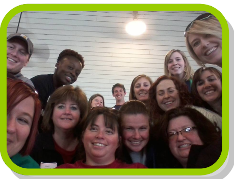
N. Central District 4-H Agents "selfie" at Teen Retreat at BJP in March.