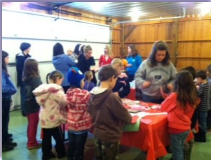
The members of the Helping Hands 4-H Clubs worked hard on their Valentines!