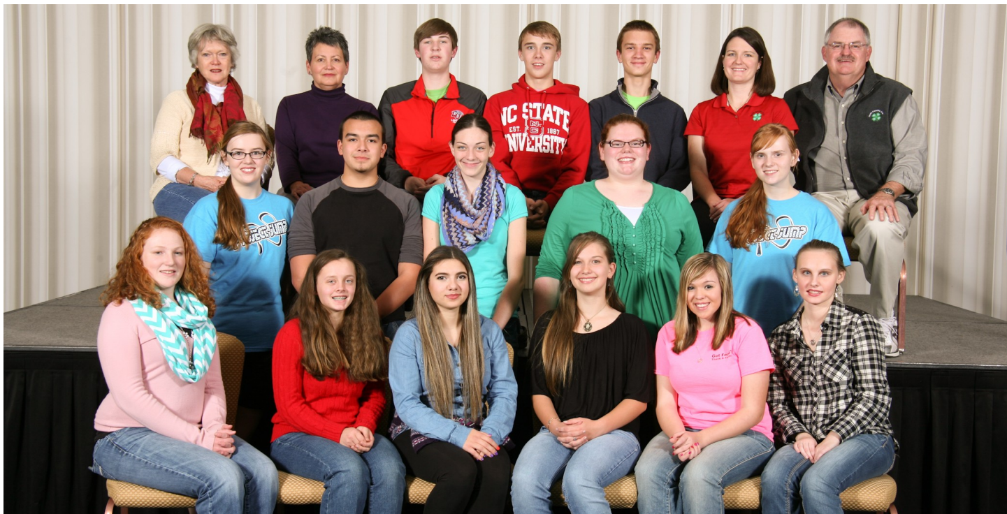
National 4-H Congress Delegates (left to right)