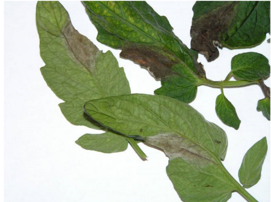
Figure 2. During humid conditions, white cottony growth of P. infestans may be visible on the underside of affected leaves.