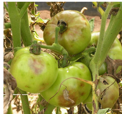
Figure 4. Infected fruit are typically firm with spots that eventually become leathery and chocolate brown in color.