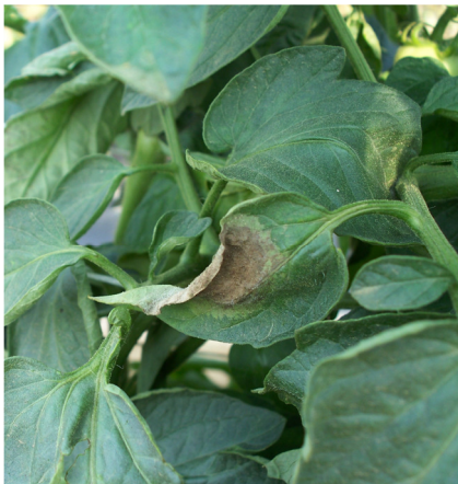
Figure 1. The first symptoms of late blight on tomato leaves are irregularly shaped, water-soaked lesions, often with a lighter halo or ring around them.

The first symptoms of late blight on tomato leaves are irregularly shaped, water-soaked lesions, often with a lighter halo or ring around them (Figure 1); these lesions are typically found on the younger, more succulent leaves in the top portion of the plant canopy. During high humidity, white cottony growth may be visible on underside of the leaf (Figure 2). Spots are visible on both sides of the leaves. As the disease progresses, lesions enlarge causing leaves to turn brown, shrivel and die (Figure 3). Late blight can also attack tomato fruit in all stages of development. Rotted fruit are typically firm with greasy spots that eventually become leathery and chocolate brown in color (Figure 4); these spots can enlarge to the point of encompassing the entire fruit.