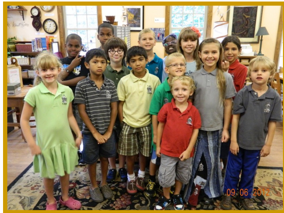
Members of the Montessori Minds 4-H Club!