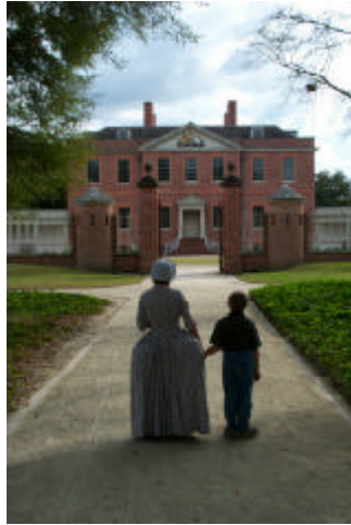
Tour stops include Biltmore Estate and Tryon Palace.

The Teachers' Tour is a 4-day residential program that focuses on the social, economic, and environmental aspects of sustainable forestry. Participants should expect a fast-paced week, with extended moderate walking, great food, and lots of fun. The first afternoon provides a short orientation to the tour and introduces teachers to forestry, followed by a gourmet dinner and a presentation about local history. Over the next three days, teachers visit a variety of mills (paper, solid-wood, furniture, plywood) and forests (private industrial, non-industrial, private, public), and are taken on a variety of educational stops (museums, state forests, experimental forests, learning centers). After reviewing the tour and sharing some insights, the teachers head home with lots of new friends, information, concepts, and materials that they can bring into their classrooms.