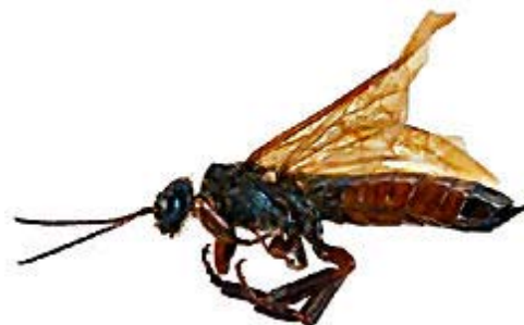
Figure 2. Sirex noctilio —adult male.