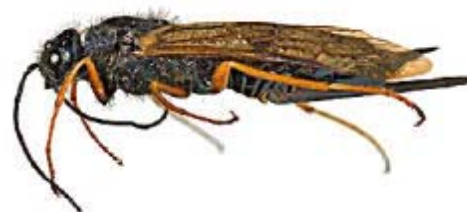
Figure 1. Sirex noctilio —adult female.

Woodwasps (or horntails) are large, robust insects, usually 1.0 to 1.5 inches long (Figures 1 and 2). Adults have a spear-shaped plate (cornus) at the tail end; in addition females have a long ovipositor under this plate. Larvae are creamy white, legless, and have a distinctive dark spine at the rear of the abdomen (Figure 3). More than a dozen species of native horntails occur in North America. No keys to identify woodwasp larvae to the species level have been developed; however, adult specimens have features to distinguish sirex woodwasp from native horntails. Key characteristics of the sirex woodwasp