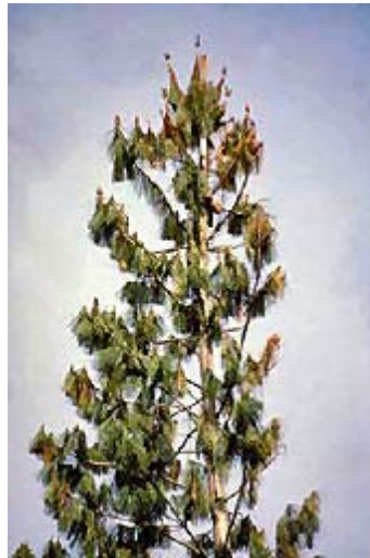
Figure 4. Green needles wilt and point straight down.

Sirex woodwasp can attack living pines, while native woodwasps attack only dead and dying trees. At low populations, sirex woodwasp selects suppressed, stressed, and injured trees for egg laying. Foliage of infested trees initially wilts (Figure 4), and then changes color from dark green to light green, to yellow, and finally to red (Figure 5), during the 3-6 months following attack. Infested trees may have resin beads or dribbles at the egg laying sites (Figure 6), which are more common at the mid-bole level. Larval galleries are tightly packed with very fine sawdust (Figure 7). As adults emerge, they chew round exit holes that vary from 1/8 to 3/8 inch in diameter (Figure 8).