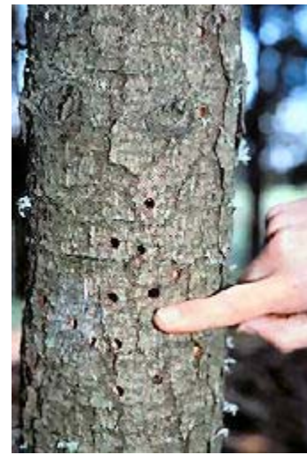
Figure 8. Round exit holes.

Sirex woodwasp has been successfully managed using biological control agents. The key agent is a parasitic nematode, Deladenus siricidicola , which infects sirex woodwasp larvae, and ultimately sterilizes the adult females. These infected females emerge and lay infertile eggs that are filled with nematodes, which sustain and spread the nematode population. The nematodes effectively regulate the woodwasp population below damaging levels. As sirex woodwasp establishes in new areas, this nematode can be easily mass-reared in the laboratory and introduced by inoculating it into infested trees. In addition to the nematode, hymenopteran parasitoids have been introduced into sirex woodwasp populations in the Southern Hemisphere, and most of them are native to North America (e.g., Megarhyssa nortoni , Rhyssa persuasoria , Rhyssa hoferi , Schlettererius cinctipes , and Ibalia leucospoides ).