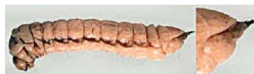
Figure 3. Sirex noctilio —larva and close-up of posterior spine.