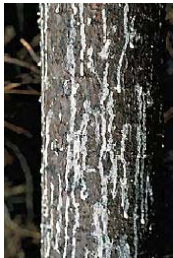
Figure 6. Resin beads and dribbles at egg-laying site.