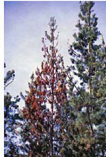
Figure 5. Needles eventually turn red.