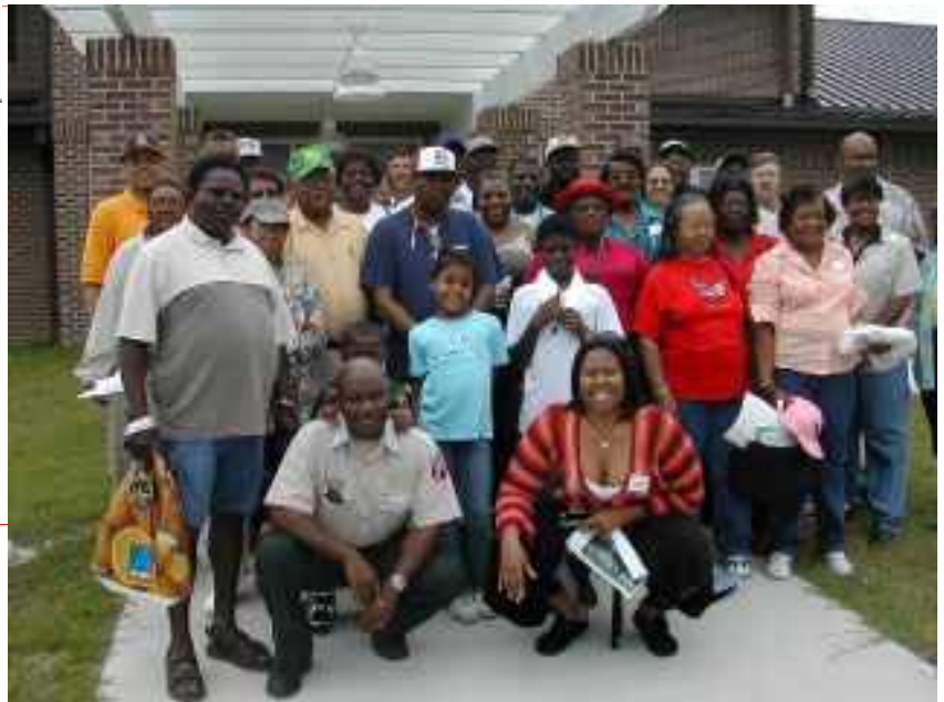
Duplin County landowners pose for a group photo with natural resource agency personnel at the first of two Summer Outreach Meetings.