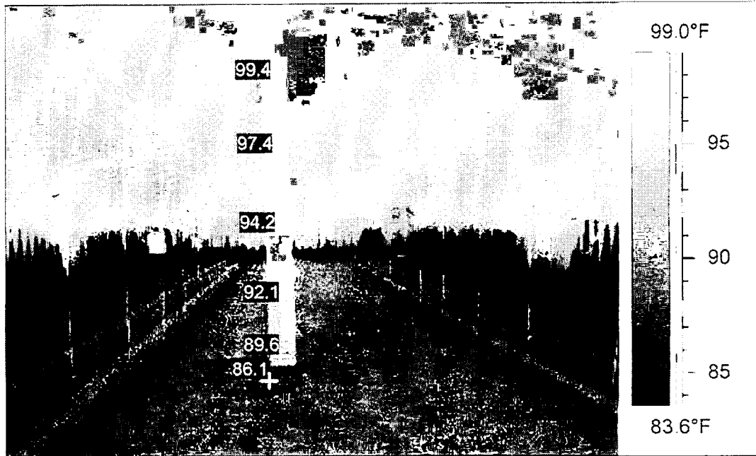
Figure 2. An infrared view of a broiler house showing temperature stratification