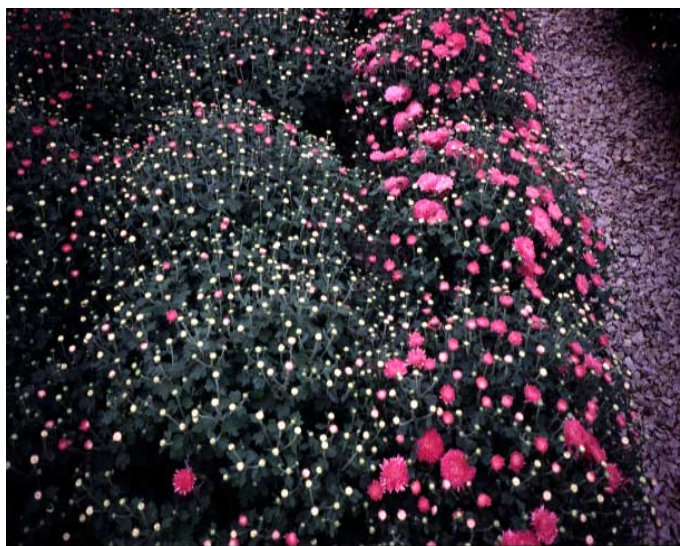
Figure 3. Florel (Left) versus manual pinch (Right). Plants were feed with 300 ppm N. Slide take 25 September 1995..

Plants treated with Florel were delayed in the appearance of flower buds and early development compared to the manually pinched plants (Figure 3), but the differences were not noticeable at the conclusion of the experiment. Plant size was similar for all plants of a given cultivar, and there was very little difference among cultivars. The plants were 16 to 19 inches tall, measuring from the ground to the top of the plant. Flowers were not counted but there seemed to be little difference among treatments (Figure 4). We modestly rated all of the plants as very good, and the plant Ingram McCall is holding (Figure 5), was typical of all of the plants in the experiment.