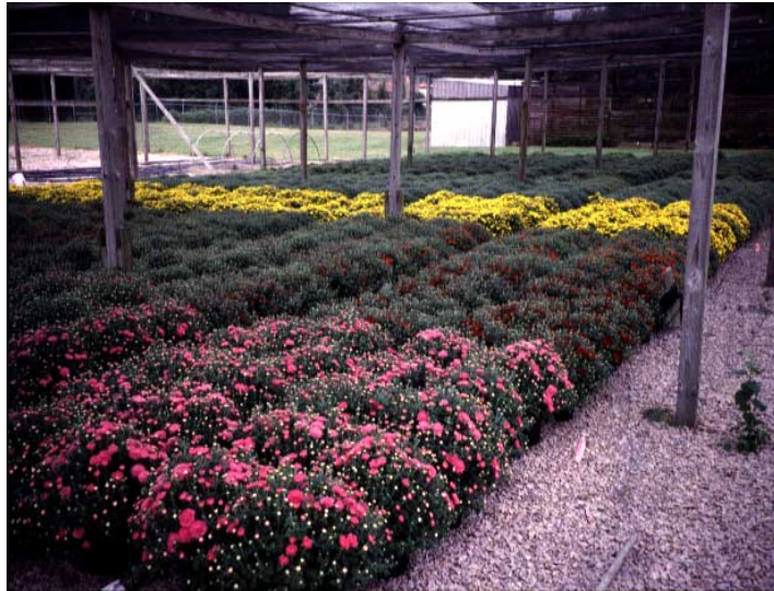
Figure 4. Although Florel delayed the onset of flower buds and early development, there was no measurable difference in date of flowering between the Florel and manual treatments.

Several applications of Florel have been suggested, to keep the plants vegetative when the grower wants them in that state, and to produce a multitude of breaks. Our plants would have suffered a loss of quality if we had more shoots at the 18" spacing. One application seemed to be very adequate. It also has been suggested that more than cutting be planted in each container, to enable a grower to plant later and still have plants of the desired size and flower number. An early June planting, a mid-June final pinch, and natural daylengths resulted in a flowering period of late September and early October. The Men's Garden Club of Wake County has a large garden mum project for the N.C. State Fair Flower Show, which is held in mid-October.