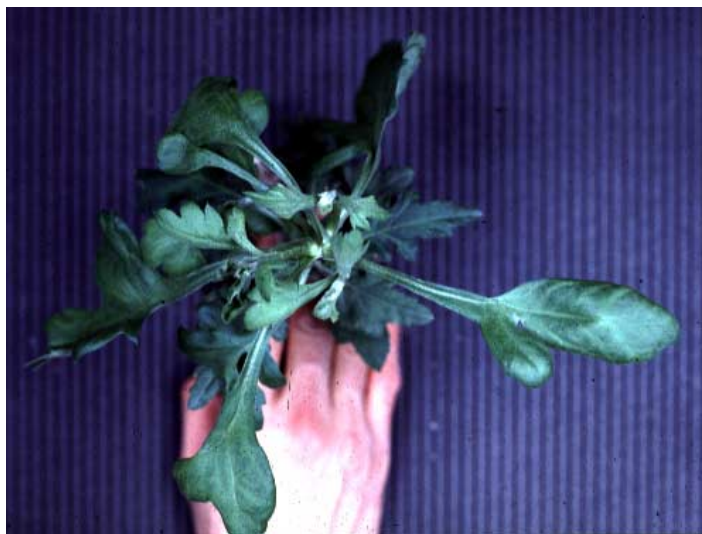
Figure 1. Ethylene injury on a 'Shoesmith' cultivar.

the need for a second manual pinch... but most growers we talked to seemed unaware of its benefits, and seemed cautious about anything that involves ethylene. Such misgivings are understandable, as the consequences of ethylene pollution in a greenhouse can be devastating (Figure 1). The controlled release of ethylene