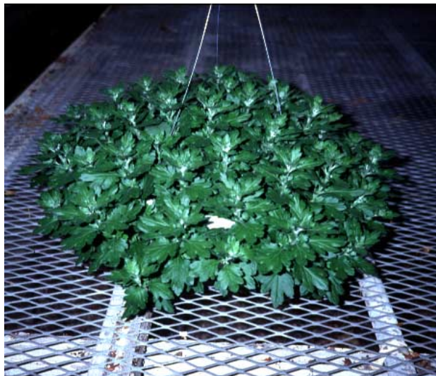
Figure 2. Florel-treated garden mum. Photo taken at C. Merkel and Son, Mentor, Ohio.

from a growth regulator such as Florel (Pistill) can be very helpful, however (Figure 2).