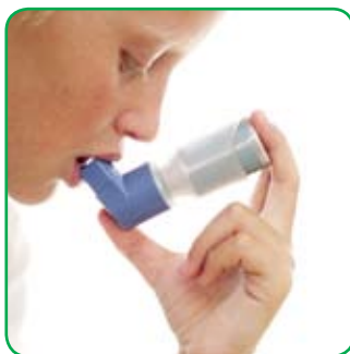
Percentage of children who have asthma, N.C. and U.S. (2006)

In 2007, approximately 59,115 N.C. children visited emergency departments due to asthma (27.2% of children with current asthma) 1 . In 2006, there were 2,867 child hospitalizations due to asthma in North Carolina. 4