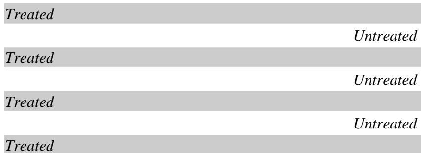
Skip-Swath pattern for Fire Ant Bait application

Based on two Alabama Extension studies by Henry Dorough, an effective application strategy is to use a 50/50 bait mix of hydromethylnon (AmdroPro) and methoprene (Extinguish). Apply in a skip-swath pattern.