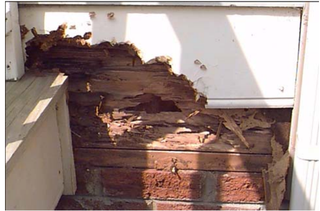
Acrobat ants often nest in moist, decaying wood.

colonies are formed by swarmers that take flight from mid-May to September.