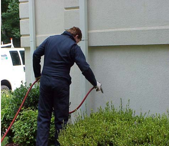
Treating along the foundation can serve as a barrier to ants entering the home. When possible, treat accessible nests

until the chemical dries (or longer if specified so on the product label). Also, watch out for pesticide drifting and contaminating toys, swimming pools, and other objects, such as barbecue grills, etc. Granular insecticides can be used in the place of sprays to treat the soil around the home. Do not apply granular insecticides if the grass is wet from rain or dew because insecticide granules will get hung up on the vegetation. The treated area should be watered lightly to ensure that the insecticide is released into the soil. If ant activity continues or even increases indoors following a perimeter treatment, it is possible that ants are nesting indoors or in the crawlspace and were “trapped” by your treatment. This can help you narrow down your search for the nest.