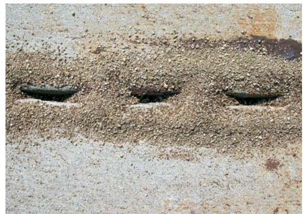
Pavement ants kick out soil around cracks and expansion joints in sidewalks.

Workers are slow-moving, \frac{1}{10} " to \frac{1}{8} " long, and dark brown in color. Both the head and thorax have numerous grooves that run lengthwise. In addition, there is a pair of spines on the thorax and a sting at the tip of the abdomen. As their name implies, pavement ants tend to nest beside and under sidewalks, driveways, patios, and foundations. The presence of a nest is often evidenced by a mound of soil around a crack in pavement. Winged reproductive ants undergo mating flights in the spring to form new colonies. Pavement ants feed on dead insects and honeydew. Indoors, they feed on most types of food, including both sweet and greasy items.