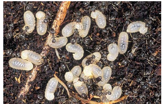
Adult ants tending “brood”. (S. Camazine – The Pennsylvania State University)

The ants that we see day to day are adult ants. Immature ants or “ brood ” are usually a whitish color and somewhat resemble fly maggots. They are found inside the nest where they are tended by adult workers. Adult ants do not grow. Some ant species may have individuals of different sizes. So, if you see “small” ants, they do not “grow up” into larger-sized ones.