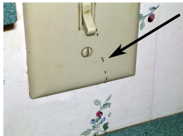
Ants seen trailing from behind an electrical switch or outlet cover may mean that you have a colony living in a wall void.

It is important to check carefully and thoroughly both indoors and outside to determine areas of ant activity, nest locations, and type of ant present. Indoors, follow ant trails to locate their entry point such as an electrical outlet or gap along a baseboard or around a water pipe. Outside, check the foundation, walkways, trees and shrubs, and in mulched areas for ant trails. Look for nests in mulch and vegetation next to the foundation. Check under potted plants, patio blocks, and stepping stones, and in piles of rocks, lumber, and firewood. Inspect the foundation to find possible ant entryways such as