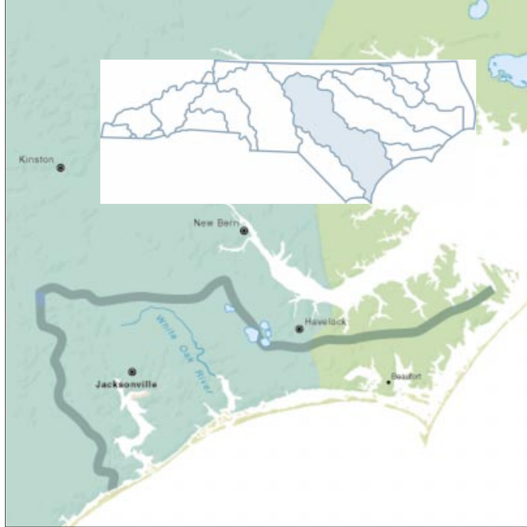
WHITE OAK RIVER BASIN