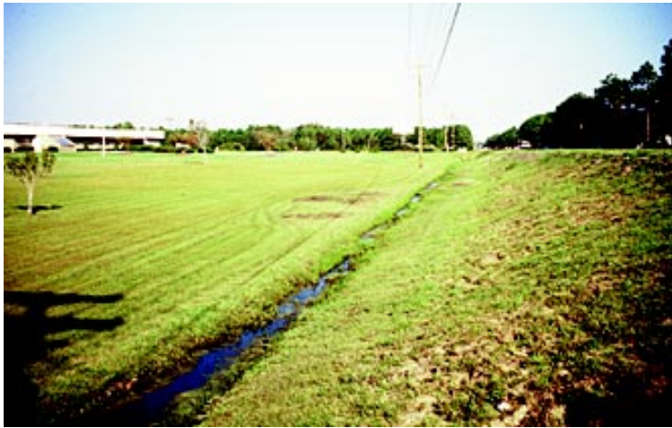
The wetland at the Carteret-Craven Electric Co-operative site will hold freshwater, slowing its discharge into Jumping Run Creek.

state and federal agencies and private industry to work toward water quality improvement. The Electric Co-operative's donation of property and cooperation on this restoration project not only demonstrates its commitment to environmental stewardship, but also exemplifies how development and restoration activities can be integrated to work together. Through such restoration efforts, it is hoped that new and innovative design and landscape techniques can be blended with development plans to promote water quality.