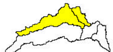
Troublesome & Little Troublesome Watersheds