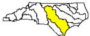
Cape Fear River Basin