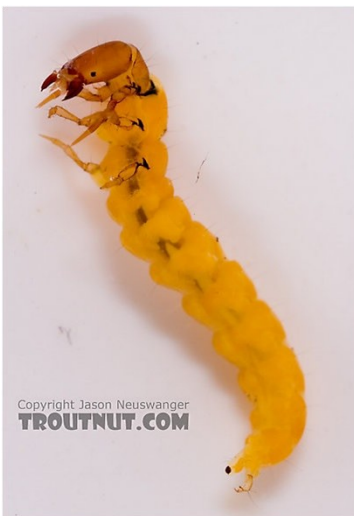
At left Chimarra sp. Diane anointed this caddisfly species, as the "star of your show", as it was previously rare but now abundant in Black Creek (a mystery!).