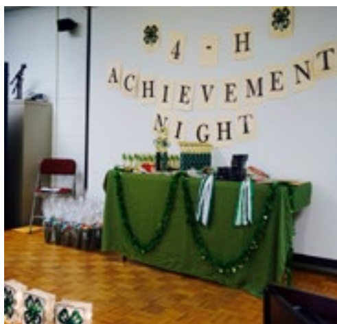
Above left: Trophies and awards ready for the night to begin!