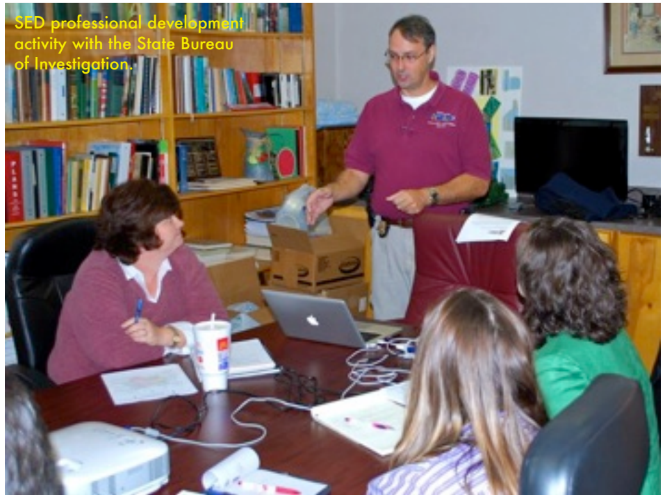
SED professional development activity with the State Bureau of Investigation.

Room reservations need to be made by calling the hotel: 828-323-1000 or online. Block of rooms listed under: Extension 4-H Agents.