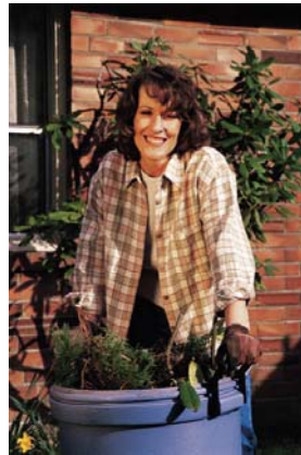
LIGHT YARD WORK