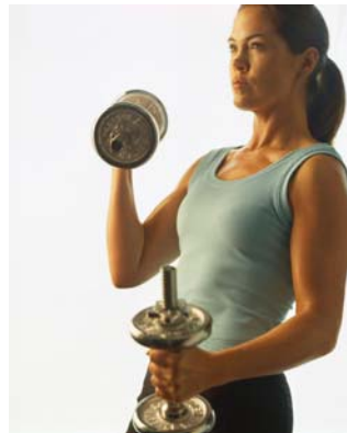
HEAVY WEIGHT LIFTING